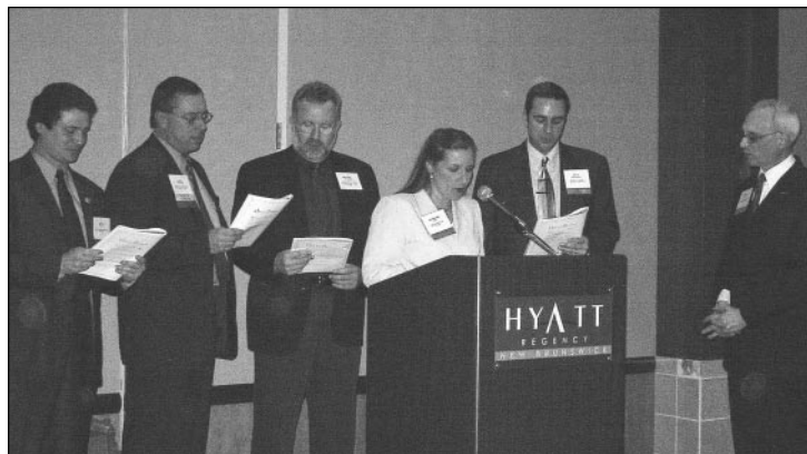
2004-2005 State Director's being installed

NJSHP's premier meeting proved to be a great success and established a new record for member attendance. More than 225 members attended the dinner dance, up by 47 percent since last year. For the actual day portion of the meeting, 119 members attended which reflected a dramatic increase by 100 percent in member attendance since last year. Members took advantage of this once-a-year opportunity to gather with colleagues to network, exchange information, see the latest pharmaceutical products and technology innovations and earn continuing education credits.